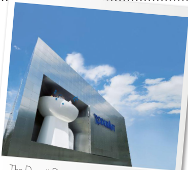
The Duravit Design Centre by Phillippe Starck.