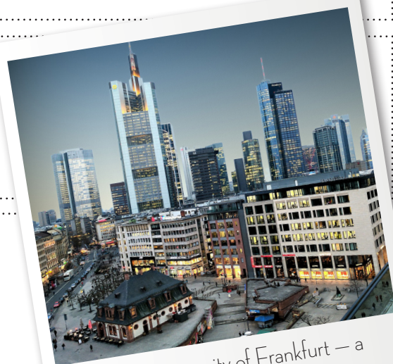
The amazing city of Frankfurt — a perfect blend of old and new.

✉ simon@thekitchenandbathroomblog.com.au ✉ melanie@thekitchenandbathroomblog.com.au