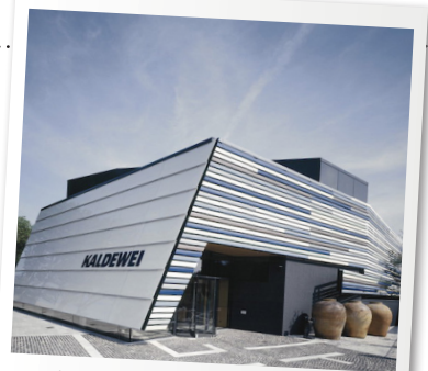
Kaldewei's headquarters in Ahlen.

A family owned company founded in 1918 in the north of Germany that is devoted to the combination of steel and enamel, Kaldewei is Europe's leading bath-maker. Its baths are formed from a thicker gauge steel with a highly-glazed porcelain enamel finish and, due to their beauty, comfort and indestructible quality, are the preferred choice for high-end bathrooms worldwide. Porcelain is the hardest wearing bath surface for unequalled durability, backed by a 30-year guarantee.